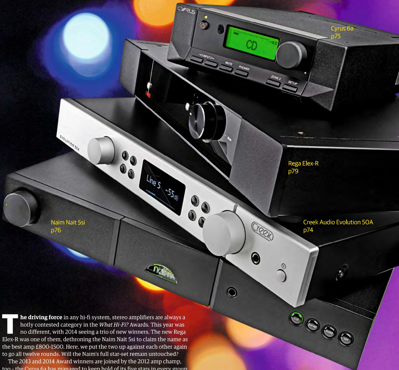
Cyrus 6a p75

Listen to our favourite tracks every month!