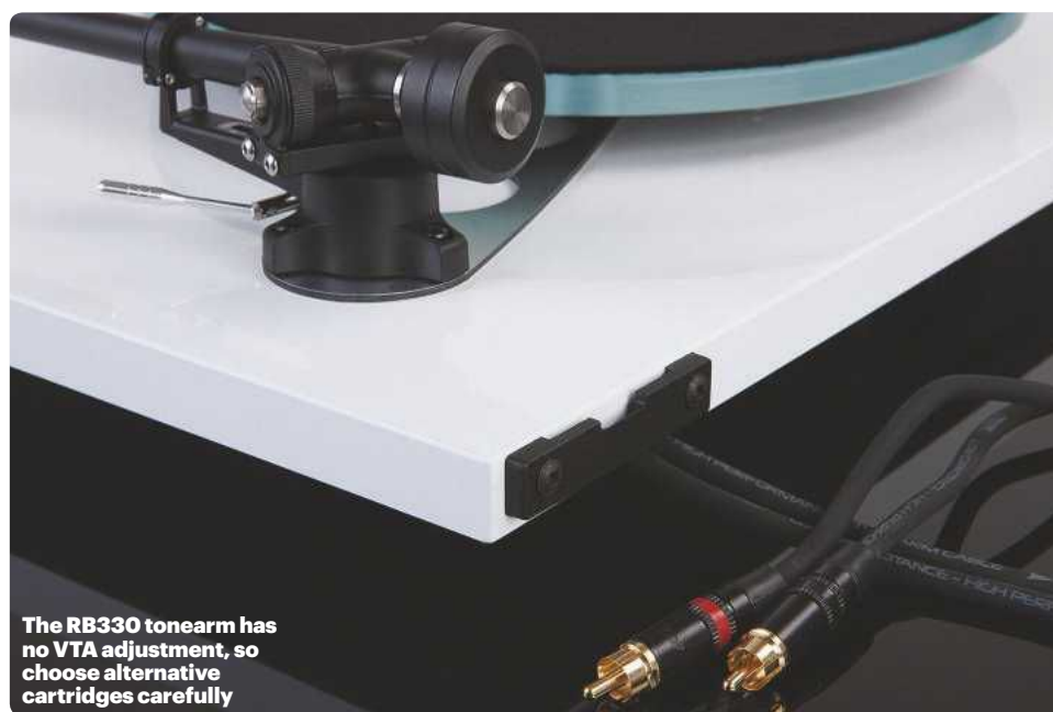
The RB330 tonearm has no VTA adjustment, so choose alternative cartridges carefully

the stiffer plinth, the Planar 3 is considerably more inert than any previous version, which should audibly reduce distortion.